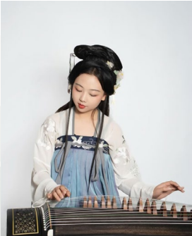
Jocelyn River High School Junior Student